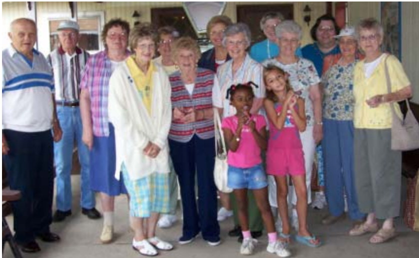
Fifteen adults and a couple of young stowaways enjoyed the Fun Timers trip last week to Rockome Gardens. The beautiful summer day was spent exploring the many exhibits, enjoying a delicious lunch, and leisurely strolling the lovely gardens. Watch for plans to be announced soon for another Fun Timers trip this fall!