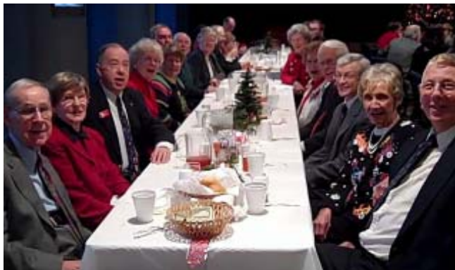
Central folks enjoy the fellowship of Come Home for Christmas!